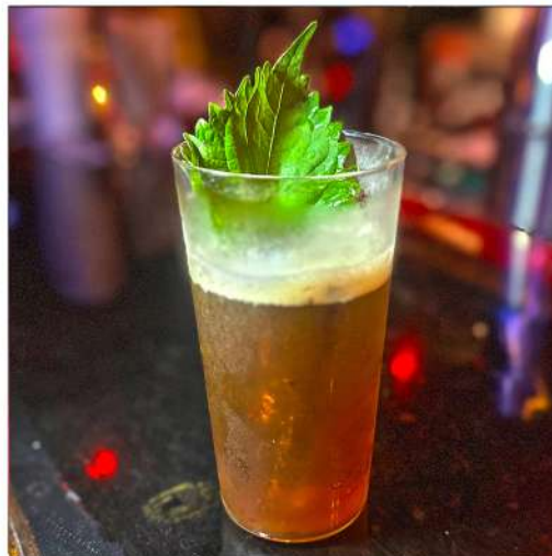
1. 鳴龍嗨波 OOLONG GIN HIGHBALL 350

This earthy blend of Oolong tea infused Gin, Shiso & Soda is a fantastically fragrant cocktail experience.