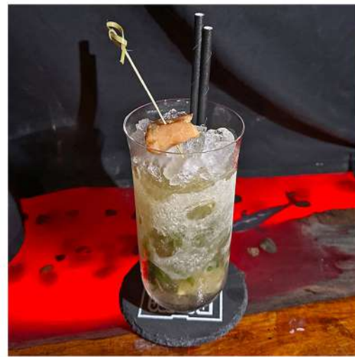
2. 荔枝沙瓦 LYCHEE SAU WAU 350

Our long loved mix of Rum, Vodka, fresh Kumquat, Lime, Mint & Lychee Juice. Available at Bad Mama since forever!